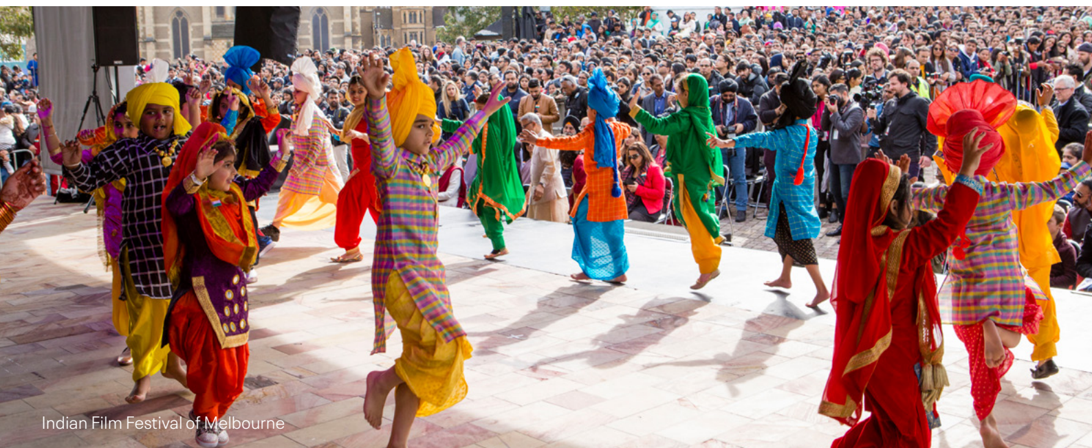
Indian Film Festival of Melbourne

Successful applicants can receive a grant of up to 25% of the project's qualifying Victorian expenditure. Projects that demonstrate significant value to Victoria may be eligible to receive more than 25%, at VicScreen's discretion.