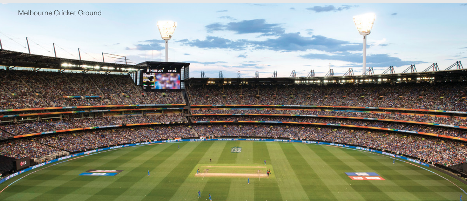
Melbourne Cricket Ground

VicScreen would be delighted to help you bring your next project to Victoria.